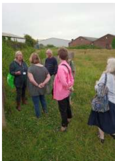
1) Tiny forest - 600 trees on size of tennis court - plants on enriched soil to mimic 200 years of forest leaf litter