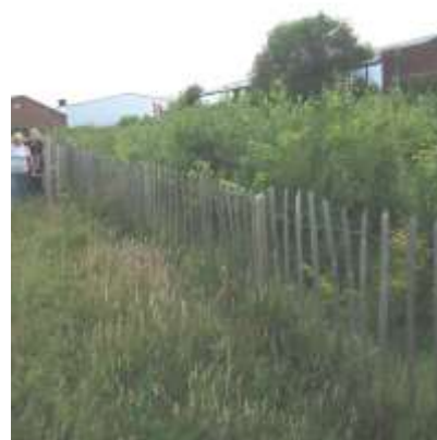
2) 600 trees - planted by traditional methods so area around size of football pitch

Carol Seery took 3 groups in June to do some citizens science at the tiny forest site at Citrine Park , Seacombe , where there are 3 projects in one,