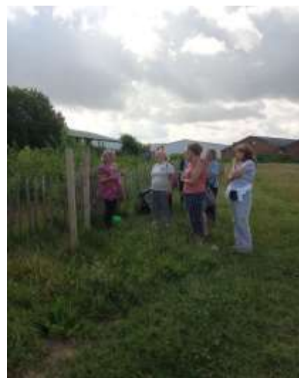
3) Area with traditional spacing but enriched soil so grass initially removed

WEN will be looking at funding to see if we can do a workshop to identify and re tag the trees in the near future so if you would like to be involved please look out for it being advertised on WEN face book page etc.